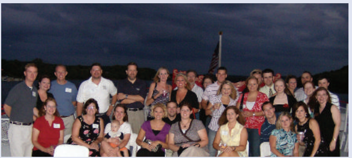
"Rewind to the Riverboat Cruise" brought back some alumni memories from the 1980s, 1990s and 2000s. Over 30 alumni enjoyed an evening of cruising and dancing along the Ohio River aboard BB Riverboats "The River Queen" on August 25.